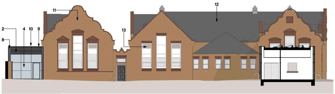
GA Elevation - A - Proposed 1:100