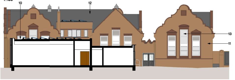
GA Elevation - E - Proposed 1:100