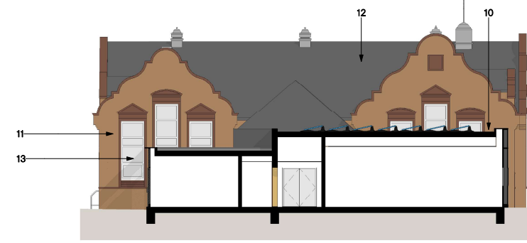
GA Elevation - D - Proposed 1:100