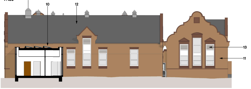
GA Elevation - C - Proposed 1:100